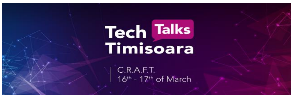
Fig.1. Main Promotional Banner of TechTalks Timisoara

In the dissertation paper, I will use the interview as an investigative tool, where I created a questionnaire with 8-10 questions, aiming to highlight the main communication strategies used by local tech and business events. The interviews are directly addressed to the communication specialists behind the event, and can also be delivered by project managers, event managers or other leaders within the organizing team. On the one hand, I have interviewed the Project Manager behind the TechTalks Timisoara conference, organized by Catalyst Solutions, a talent and employee branding agency. This is a conference organized twice a year, during the job trade fair “Angajatori de top”, taking place in two cities, Timisoara and Bucharest.