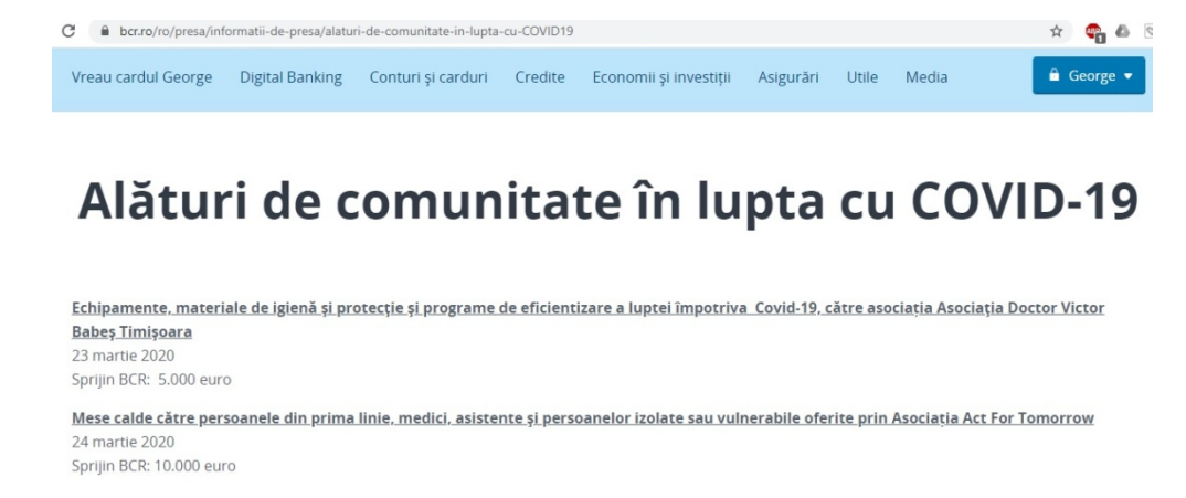
Fig.2. Banca Comercială Română's website section – Help against COVID-19