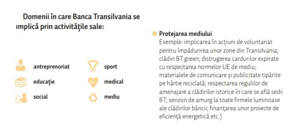
Fig.3. CSR involvement, Banca Transilvania

Before this crisis situation has made its debut, both banks were already involved in CSR actions in various CSR areas, as it will be illustrated in figures 3 and 4.