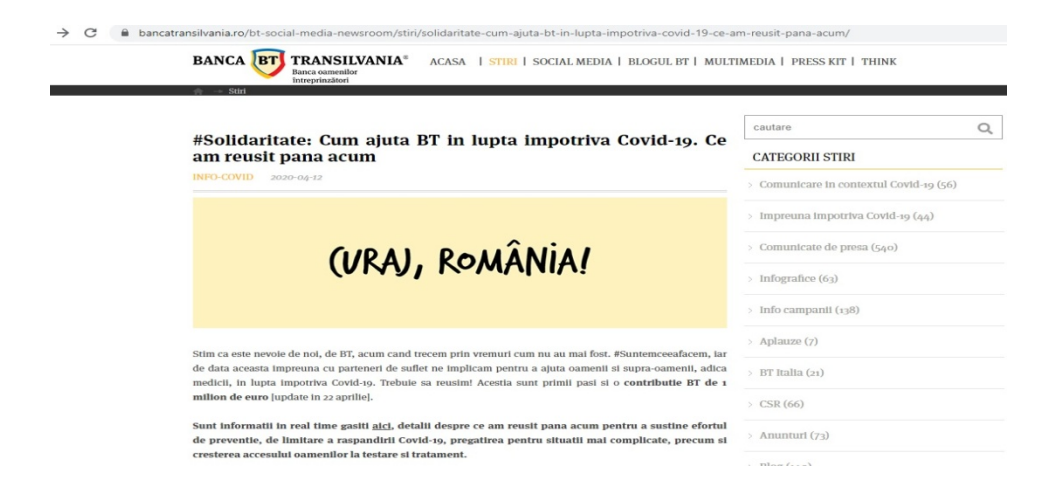
Fig.1. Banca Transilvania's website section – Help against COVID-19

contains the date, the amount, and the distribution of the measures that are meant to help in this context